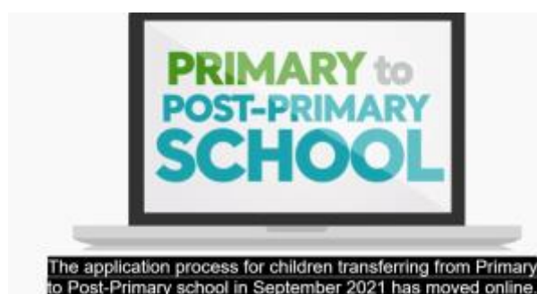
2 - Post Primary Admissions